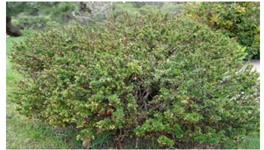
Mature Japanese barberry shrub

Leaf colors include yellow, green, purple and red; numerous varieties have been introduced for landscape planting. Japanese barberry has a dense, umbrella-shaped growth habit. Due to this, it creates a humid microclimate which ticks require for survival as they wait for a host. Areas with Japanese barberry infestations have nearly 60% more lyme-carrying ticks than areas where control measures have been taken.