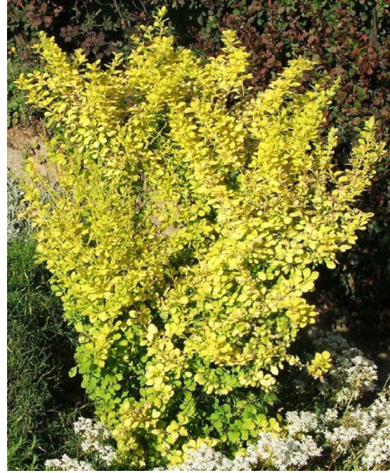
Japanese barberry leaves, berries, and spines in late summer, and a pale variety planted in an ornamental bed

The purpose of this flyer is to show you what it is, how to identify it, and what you can do about it.